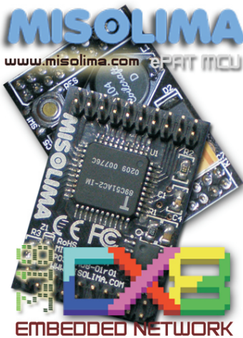
Illustration 2. ePAT MCU module

The new version of DOLLx8 network system which is already being integrated into several embedded devices are also being announced available in the form of small compact module named MISOLIMA ePAT MCU. ePAT is aimed for easy embedded technology integration, adaptation and educational purposes for the digital industrial embedded marketplace as well as hobby electronic enthusiasts and of course, the DOLLx8 is now available for all users and available as embedded module for new projects. ePAT exist with or without DC-DC switching power supply, securing seamless integration in a wide range of application using a wide range of power sources. As a consequence, the new DOLLx8 embedded computing and communications technology can quite literally be everywhere and become an integrated part of all aspects of life, that being as an almost invisible component of almost everything in everyone's surroundings.